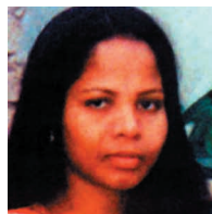
Asia Bibi District Jail Sheikhupura Punjab Pakistan